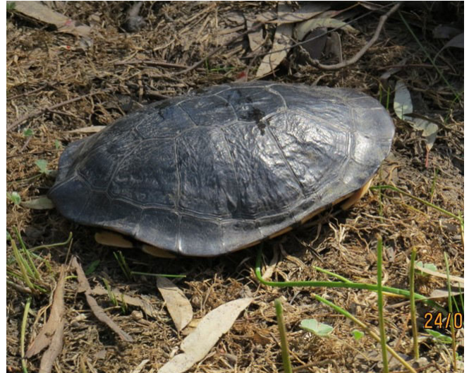
Eastern Long Neck Turtle. Playing at hiding.