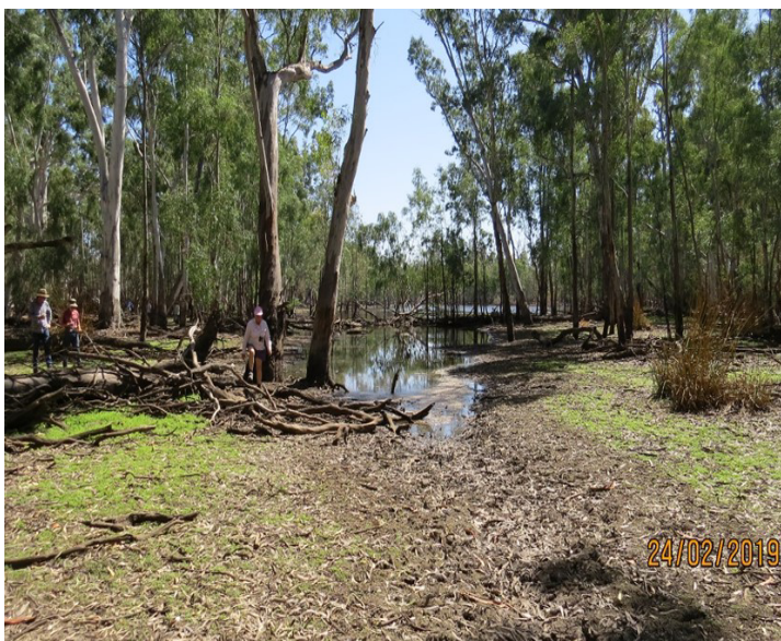
‘THE NECK’. Swamp is behind me, lagoon ahead.