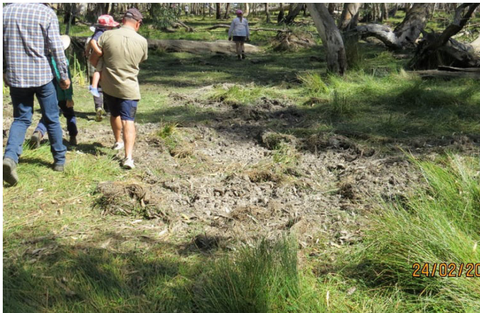
Evidence of Pig Rootings.