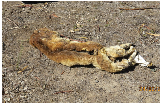
Small deer carcass. Skeleton is 4m away.