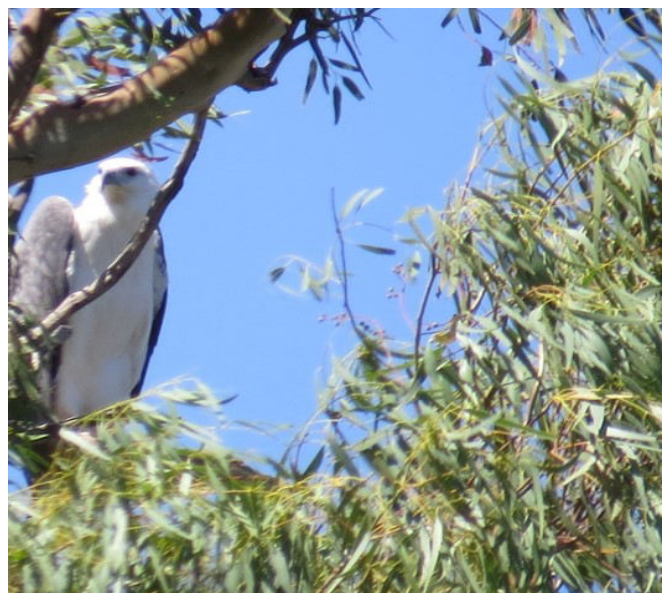
Sea Eagle waiting for us to depart. Distance more than 100m away.