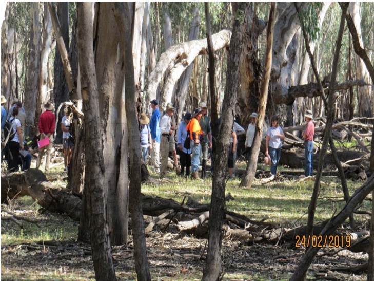
Note the lack of understorey plants.